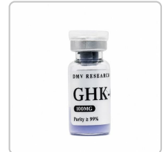
GHK-Cu 100mg - LOT-2026-001